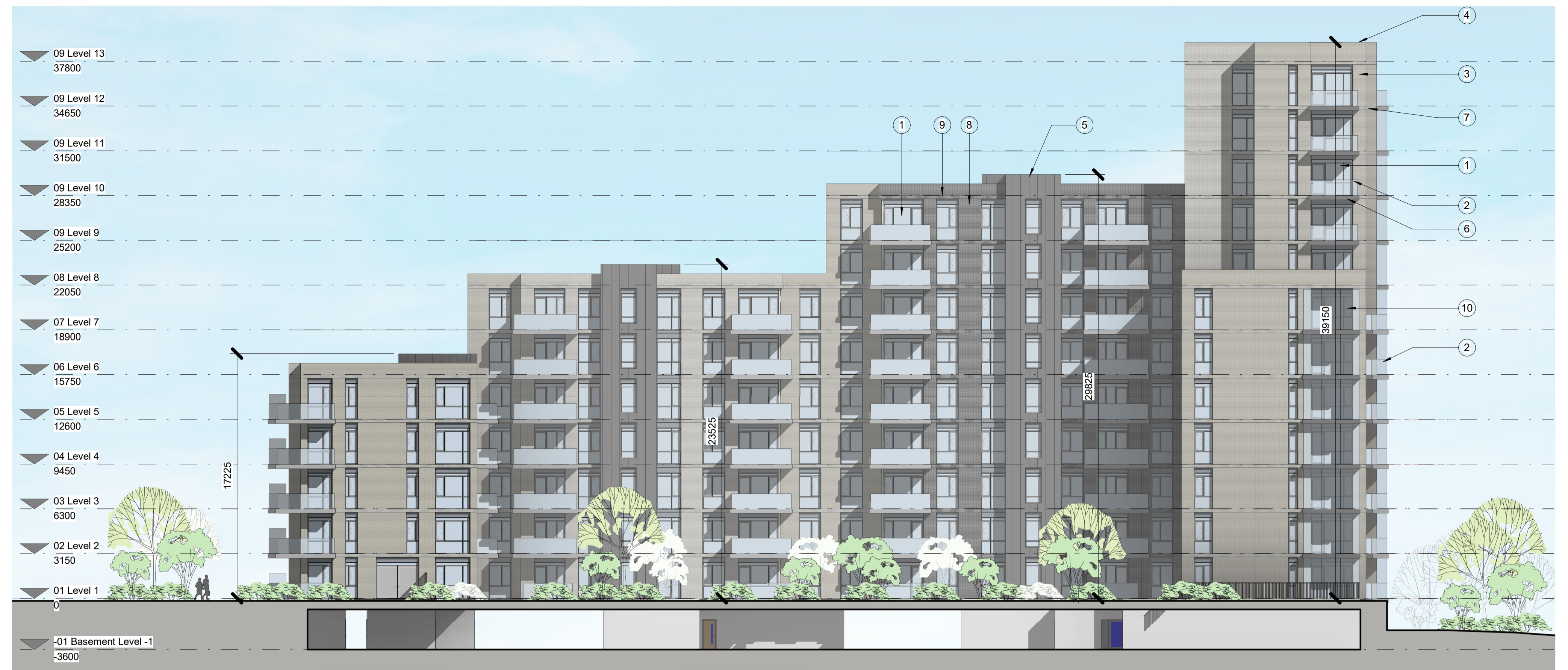
1 Sector 7 Block 2 East Elevation (1) 1 : 200